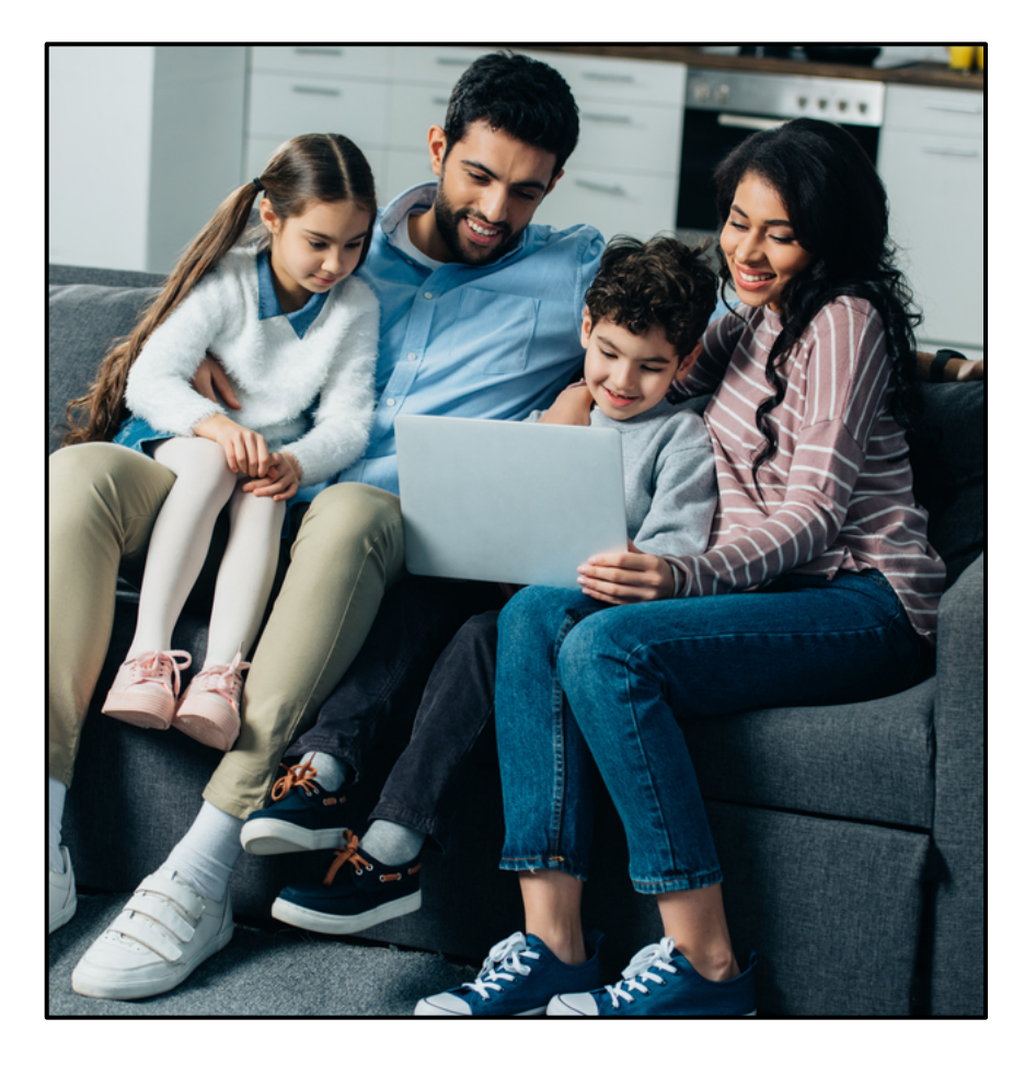
A Home Is Where Someone Lives