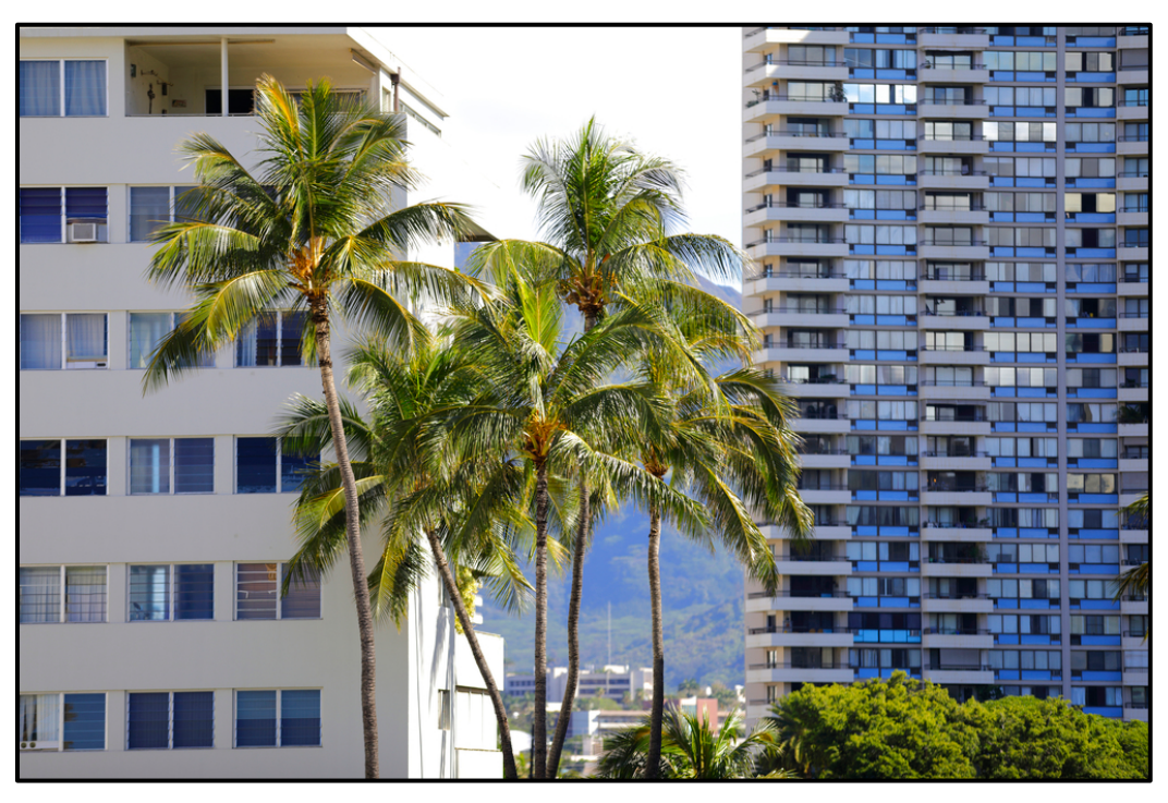
Hawaii. This is okay.