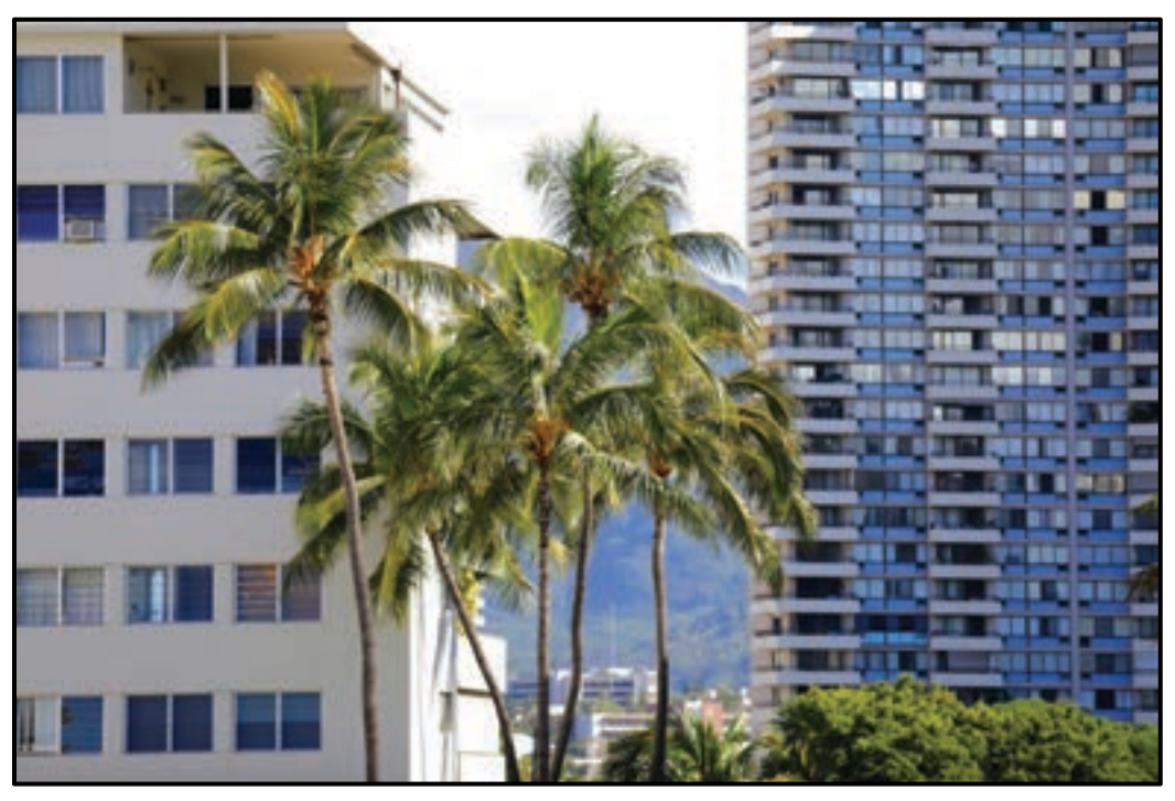
Hawaii. This is okay.