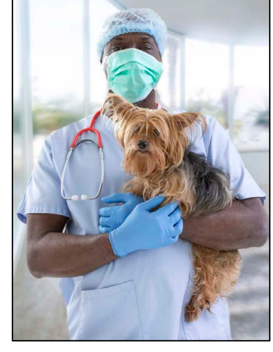
Who knows how to take important pictures?