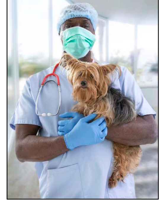
Who knows how to help animals if they are hurt or sick?